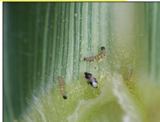
Larvae in leaf axil, feeding on pollen grains, with a minute pirate bug predator . MPB were seen on WBC egg masses in the field, and were common in tassels, axils, and silks with larvae. It may be a key natural enemy of eggs and small WBC caterpillars.