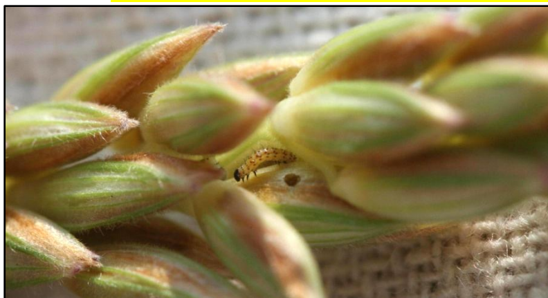
Tiny larva in tassel. Note small hole where it fed on pollen.

Most larvae in or near tassel, or in leaf axils, feeding on pollen Some (20% or less) headed down the plant into the silks